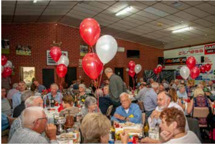
Our very smart venue