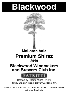
Premium Shiraz $170 per doz