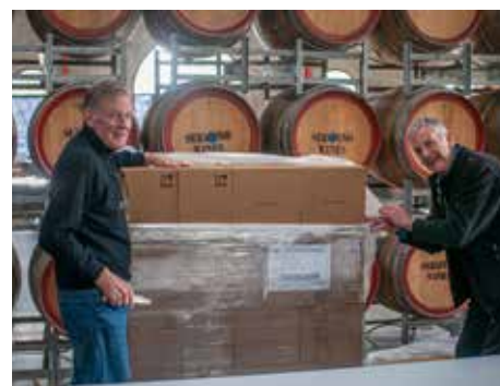
Members and freinds at the Serifino wine launch