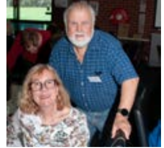
2024 Presentation Lunch